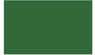
MIG 6100 RAL CLASSIC 6001